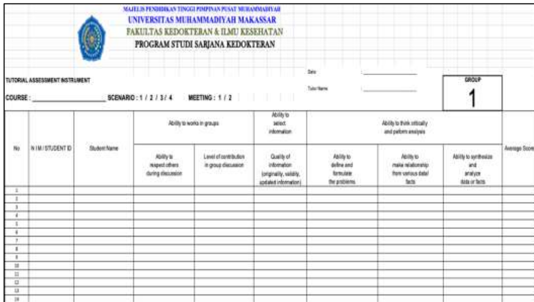
Figure 4: Tutorial Assessment Instruments

In PBL, students were assessed based on actual performance in their learning setting. Students were evaluated in terms of their ability to make relevant hypotheses, identify their learning needs, use appropriate learning resources, provide evidence of learning, and act as a responsible team member in the tutorial group (Valle et al., 1999). Based on that, we developed instruments that can evaluate those abilities, including (1) ability to respect others during the discussion, (2) contribution in discussion, (3) quality of information, (4) ability to define and formulate problems, (5) ability to make a relationship from various data/facts and (6) ability to analyze and synthesize data/facts. A 100-point grading system was used, where the total score represents "unsatisfactory" (< 60), "good" (60 – 80), and "outstanding" (> 80)"(Figure 4).