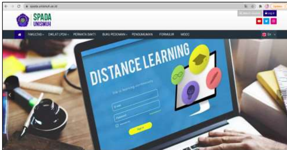
Figure 1: The dashboard of our LMS SPADA

Modules used in the Neuropsychiatry course consist of 2 modules; headache and hemiparesis. The topic of the module is based on a list of competencies for general practitioners listed in the Indonesian Doctors Competency Standards (SKDI) in 2012 (Indonesia, 2012). These modules are equipped with scenarios, learning strategies, student assignments, guidance for tutors, several alternative questions and answers, and several references. Each module consists of four different scenarios. These modules were given to the students via Learning Management System (LMS) Moodle, known as SPADA (Sistem Pembelajaran Daring) at site www.spada.unismuh.ac.id . (Figure 1; Figure 2)