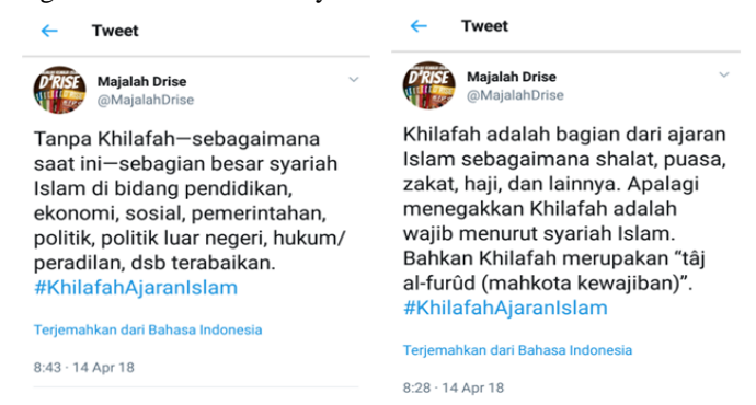
Picture 2. D'rise magazine's tweet about the ideology of the Khilafah

according to the Islamic Sharia. Even the Caliphate was the "taj al-furud (Crown liability)". #KhilafahAjaranIslam.