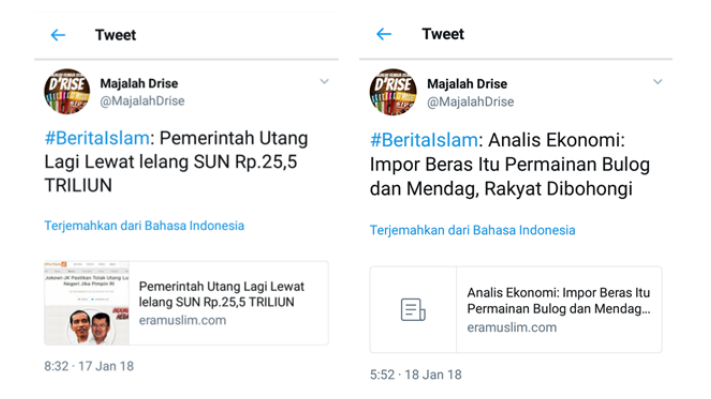
Picture 3. D'rise magazine's tweet about conservative ideology of the government

(2017) concluded that eramuslim.com is the mass media online that explicitly voicing the literal Islam is conservative. This is demonstrated through the production and consumption of text that uses a strategy of resistance.